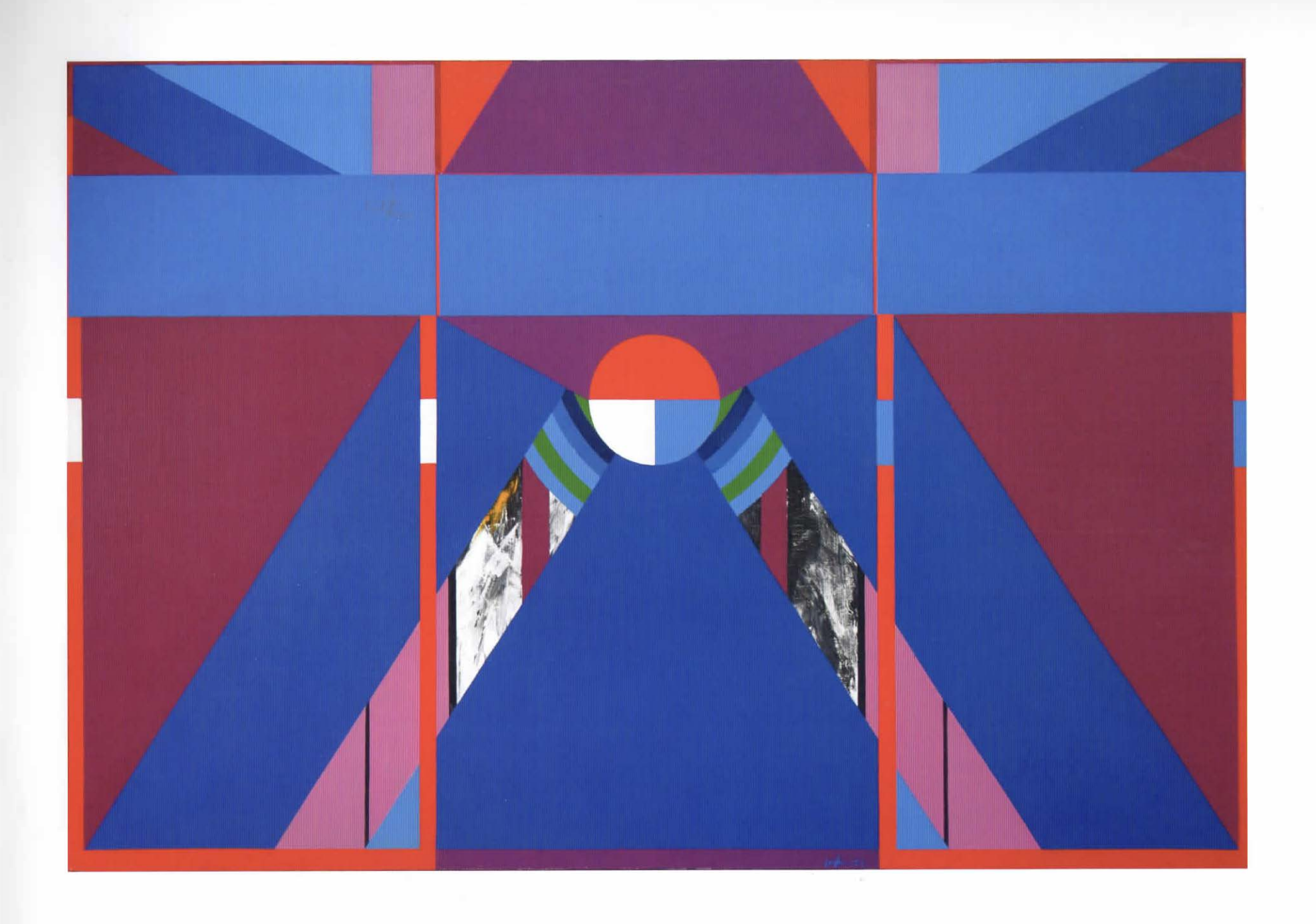
Catalogue Cover / Frontispiece - "Study for Mahler's Castle" (1972)