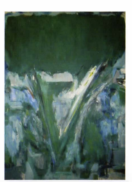
LASSEMANN 1958 oil on canvas 70 x 50 inches PRIVATE COLLECTION

By the time he painted Lasemann in 1958, in which a Rothko-like rectangle floats near the top supported by a central triangular form, Hopkins had begun to shift into a much more powerful compositional gear. In 1959 and 1960 he began to underline this stability with a somber, predominantly gray, blue, and brown range of color. Curvilinear forms yielded to the domination of straight lines and square edges during these years, notto reassert themselves until the mid-sixties with the re-emergence of the circle in his work. While the structural scaffoldings became more architecturally sound, his brushwork became increasingly freer and more arbitrary. His technical handling of paint—splattering, scraping, scumbling, dragging, and dry brushing it across the surface—reached a peak of facility during the early