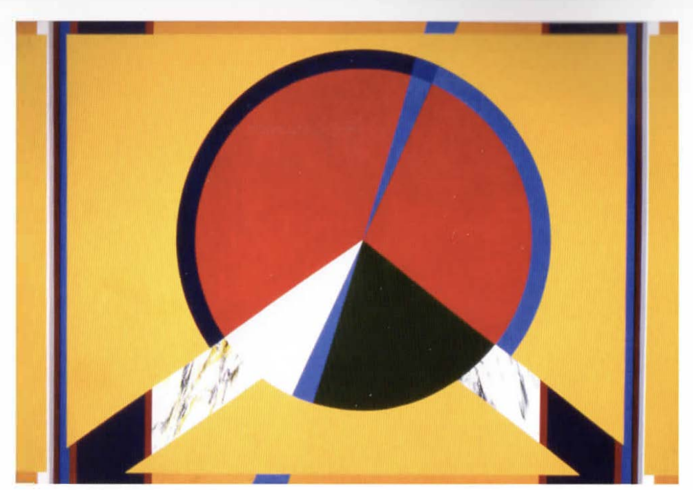
LIBRA 1963 silkscreen 21 x 29 inches COLLECTION PROVINCETOWN ART ASSOCIATION AND MUSEUM

These principles receive their first full crystallization in the Gemini series of monumental black and white paintings, begun in 1968. Massive planes, like fragments of a secret world of unknowable imagery, lie tantalizingly near visibility beneath their surfaces. Both color and painterly freedom are minimized in favor of an austere conceptual rigor in a painting like the great Gemini I , in the collection of Maximilian Schell. The grand formality of such a work is diffused in other paintings, like Saratoga of 1969 and Norbeck of 1970, in order to promote coloristic expressivity. Also in 1970, Hopkins began the Montezuma series of light-filled, drastically simplified paintings