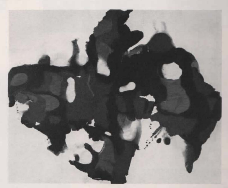
STANLEY TWARDOWICZ: #6, oil, 27½ x 33½", 1957. Collection of the artist.